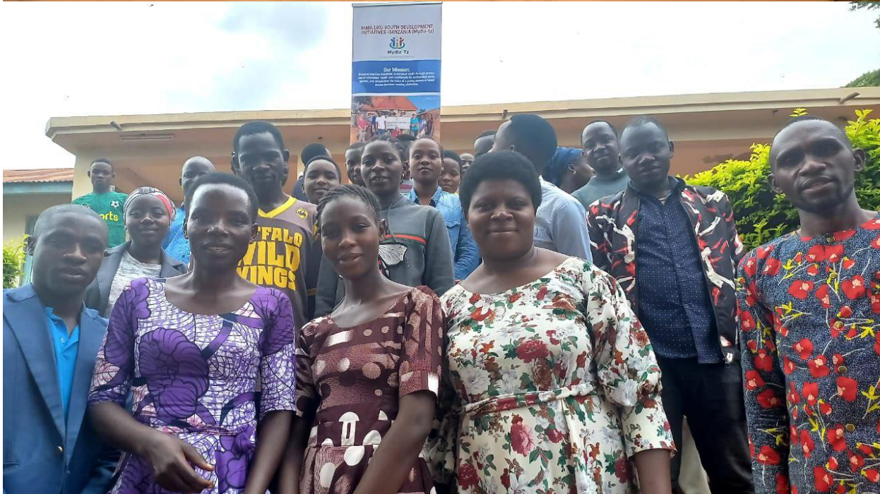
Photos: After the entrepreneurship & life skills training for youth of Kasulu district, held at Kasulu district council's venue