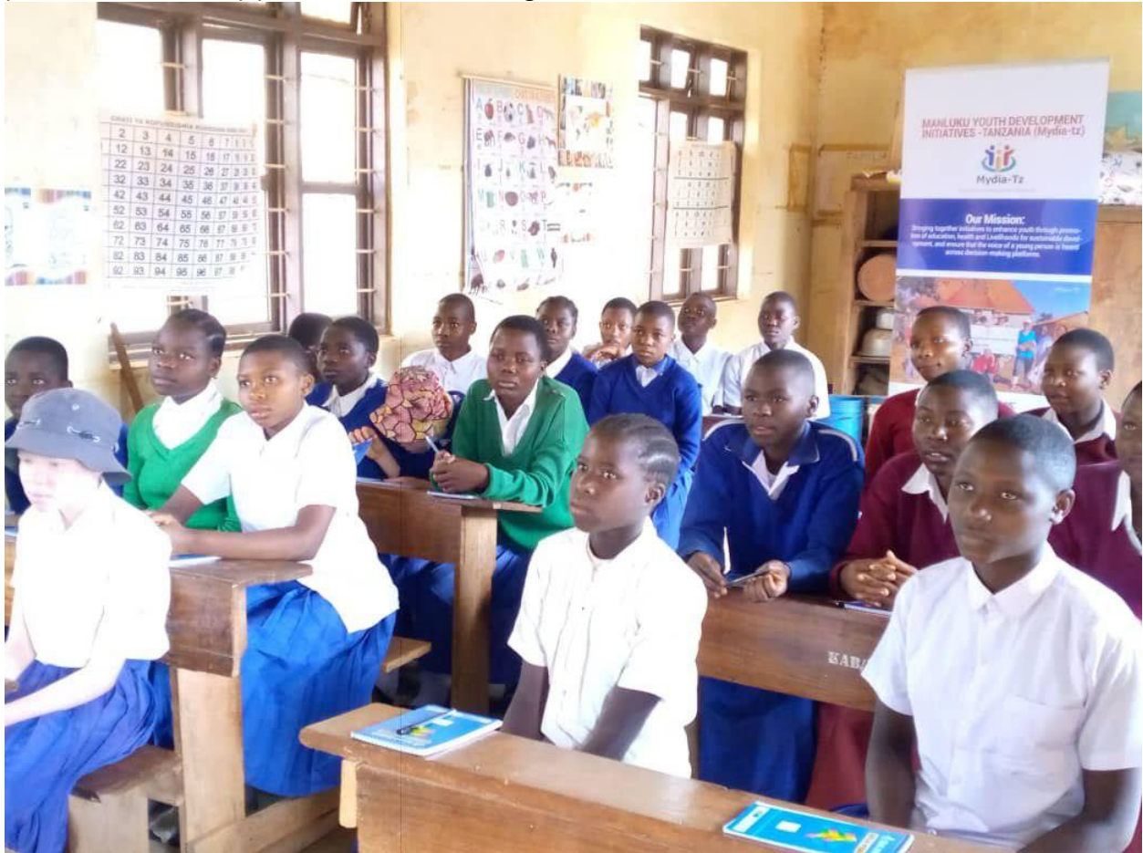
Photo showing adolescent girls during the training.

During the reporting period, under WASH and SRHRs, Mydia-tz got support from two different donors for two different projects. One of the projects “Menstrual Hygiene Management (MHM) program to adolescent girls with & without Disabilities” was funded by a private donor from the USA and has reached 30 adolescent girls and three female teachers from three schools of Kabanga Mazoezi, Lugole and Nyankungwe primary schools of Kasulu district, through a two days training on Menstrual hygiene management and gender related issues. The program also provided 60 sanitary pads to the 30 trained girls.