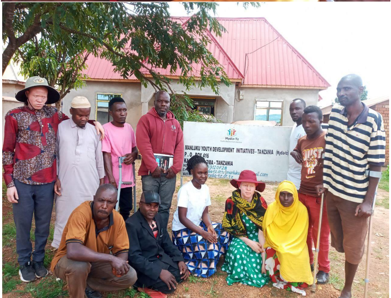
Photo: Mydia-tz and Tumaini Walemavu signs a partnership Memorandum of Understanding (MoU), at Mydia-tz office