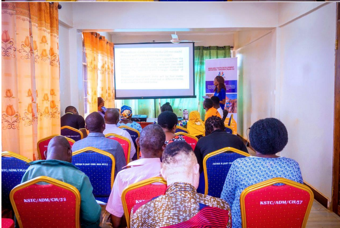
Photos showing some presentations during the Tupange maisha, kick off meeting held at Kasulu town council's hall.

Mydia-tz with support from both Coaches across Continent (CAC) and Engineers Without Borders (EWB-USA), Greater Austin Chapter celebrated the Global Day of Play at both Biharu and Kabanga villages. CAC supported a training and celebration manual while EWB-USA