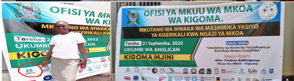
Photo: Kigoma region development stakeholders meeting organized by the Kigoma region administration held at Kigoma town