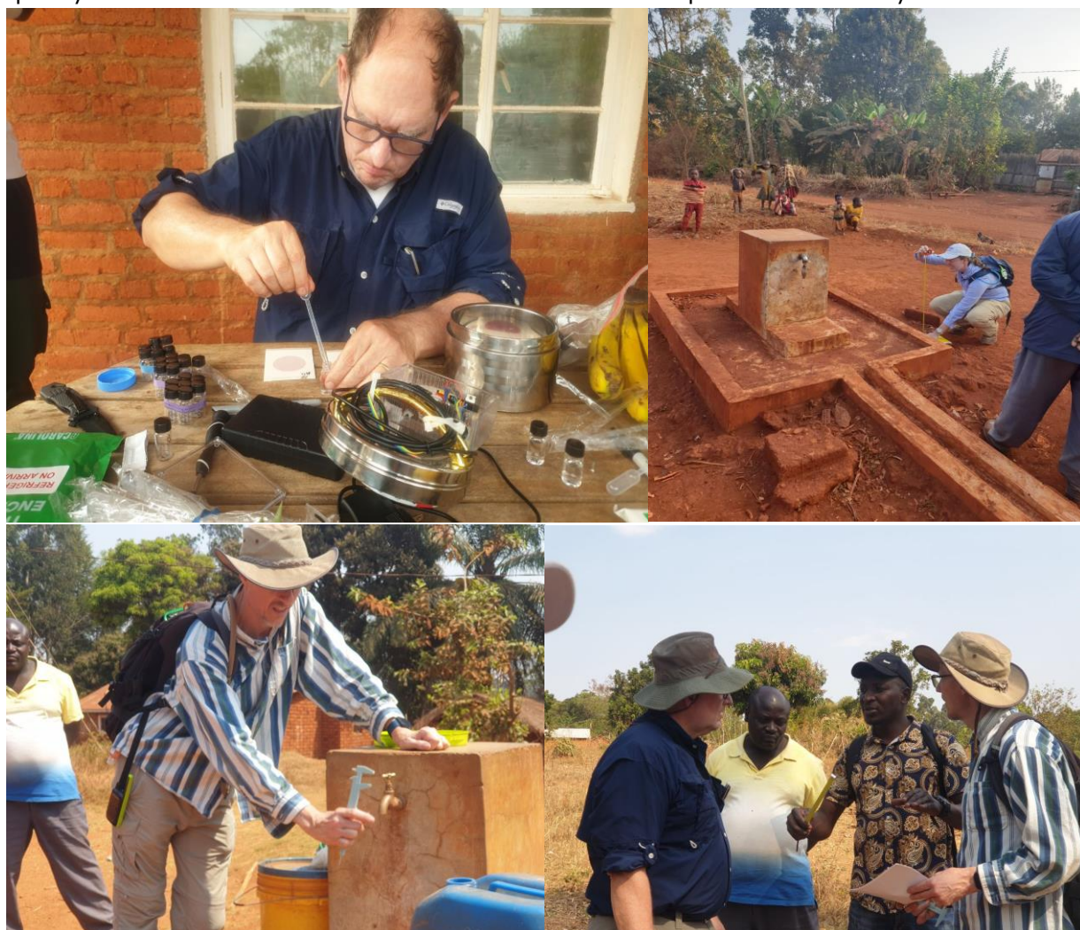
Some photos showing the assessment team during EWB-USA visit at Biharu ward of Buhigwe district, Kigoma

On the other hand, under Water, Sanitation and Hygiene (WASH); the organization with collaboration with EWB-USA, Greater Austin chapter continued with its project for the rehabilitation Biharu Gravity water system at Biharu ward, whereby all water flow and water quality assessments were finalized. Below are some of the photos for the very activities.