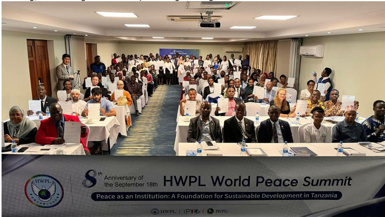
Photo: Mydia-tz attending the HWPL world peace summit, held in Dar es Salaam – Tanzania

Mydia-tz has continued its cooperation with the Government of Tanzania through its respective offices, being a member of the national sector networks like Tanzania Education Network/Mtandao wa Elimu Tanzania (TEN/MET) and Tanzania Water and Sanitation Network (TAWASANET). The organization's staff has been attending different capacity building, networking and advocacy meetings through these links.