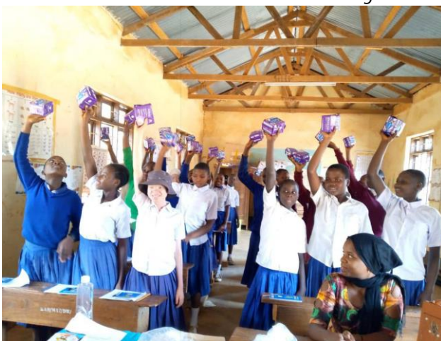
Trainees showing some distributed sanitary pads