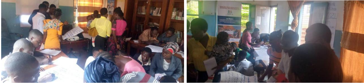
Photo: During the entrepreneurship & life skills training for youth of Kasulu district, held at Kasulu district council's venue

During the reporting period, Mydia-tz has conducted a two days entrepreneurship and life skills training for 35 youth (male and female) from Nyumbigwa and Msambara wards of Kasulu district, facilitated by one of the Kasulu district's government officials as a trainer.