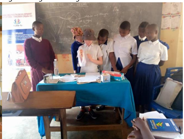
Adolescent girl with Albinism, demonstrating how to use a pad

The other project namely “Tupange Maisha” is a six months, on-going project aiming at increasing knowledge to reproductive youth of Kasulu district on SRHRs and family planning.