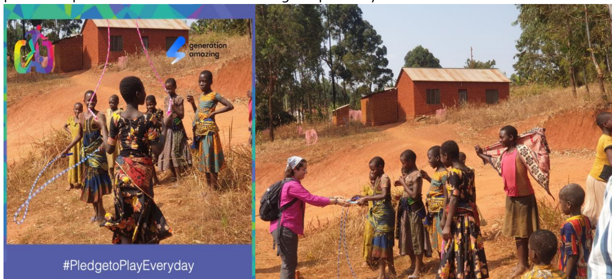
Phot: Global Day of Play

provided sports materials to be used during the peak day.