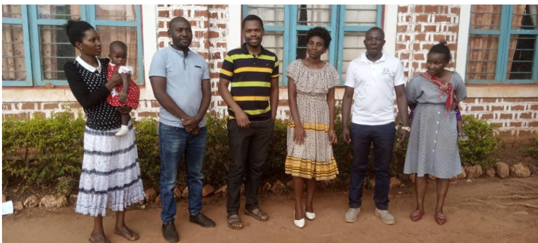
Photo: Part of the Mydia-tz staff