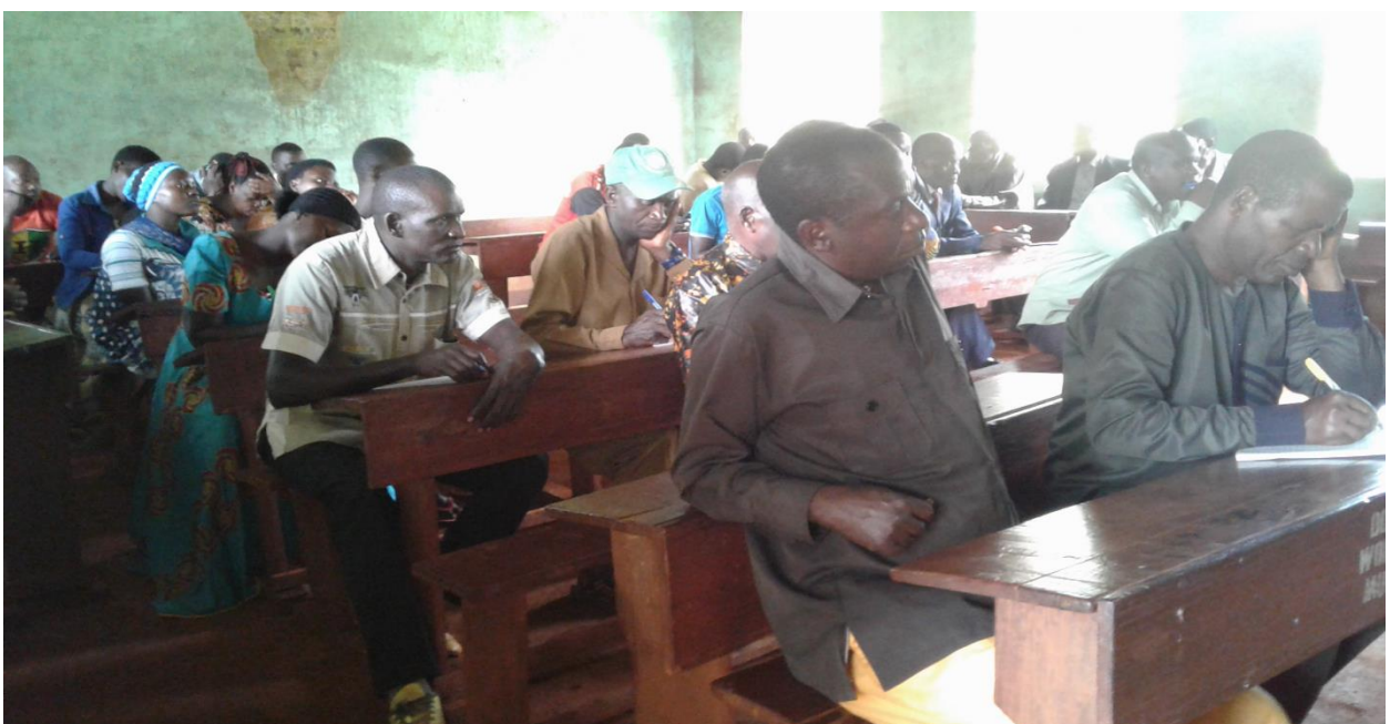
Photo: A training for community members, held in April 2021 at Biharu ward