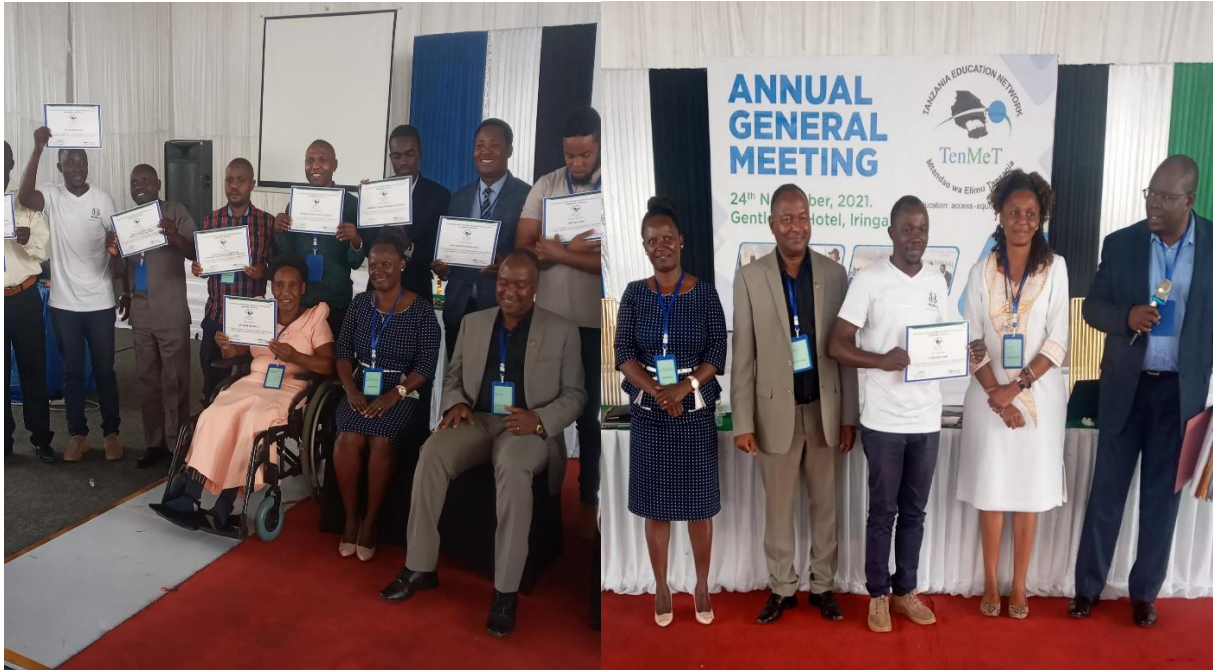
Photo: Mydia-tz's confirmation as a member of TEN/MET during the 2021 annual General Meeting

Under Education, the organization in the last year continued with monitoring of the provided sanitation facilities including handwashing facilities and cleaning materials at the five primary schools of Murubona, Juhudi, Kiganamo, Mwilamvya and Kasulu. However, it has secured a land in Kasulu town for construction of the ECCD center. Mydia-tz has also successfully become a member of the Tanzania Education Network (TEN/MET) and will be working with the network in the specific areas of child protection, School –WASH, Gender equality and Early Child Care & Development(ECCD).