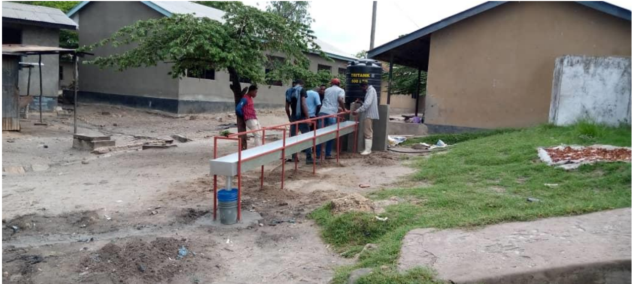
Phot: Joint monitoring, mass handwashing points at schools