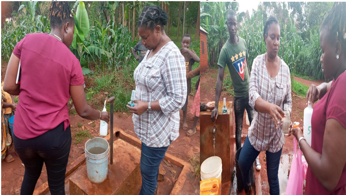
Photo: Collection of sample for water quality tests at Biharu ward of Buhigwe district

Mydia-tz also secured fund from EWB-USA, Greater Austin chapter for Installation of 35 handwashing points, distribution of 1,750Kgs of powder soap for institutions & communal