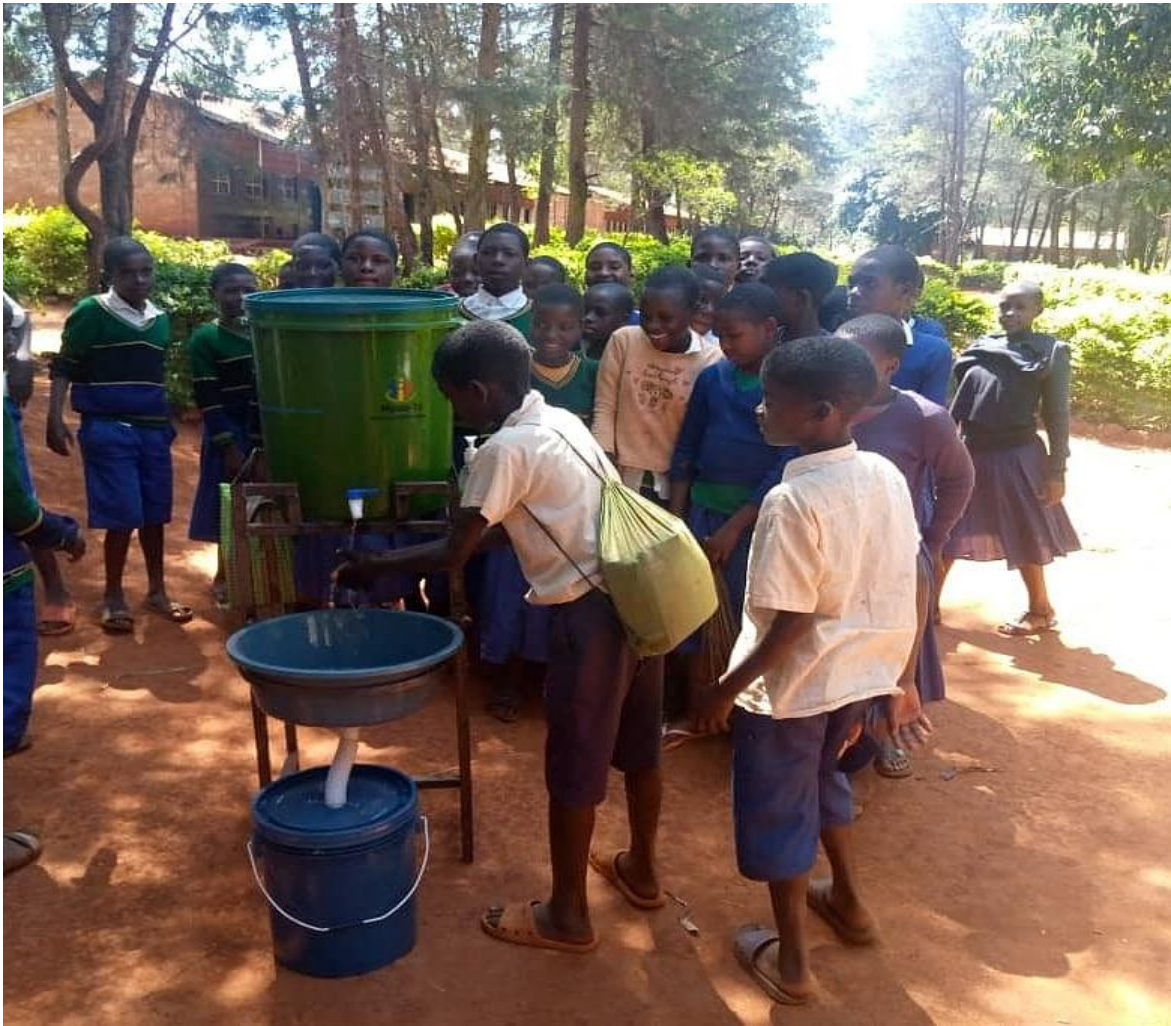
Phot: Handwashing induction to pupils at Kigege Primary school of Biharu ward.