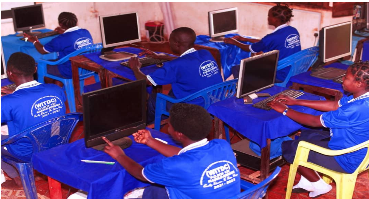
Photo: Some students for Mydia-tz & WETAAIFICO partnered computer training program at WITDC training center