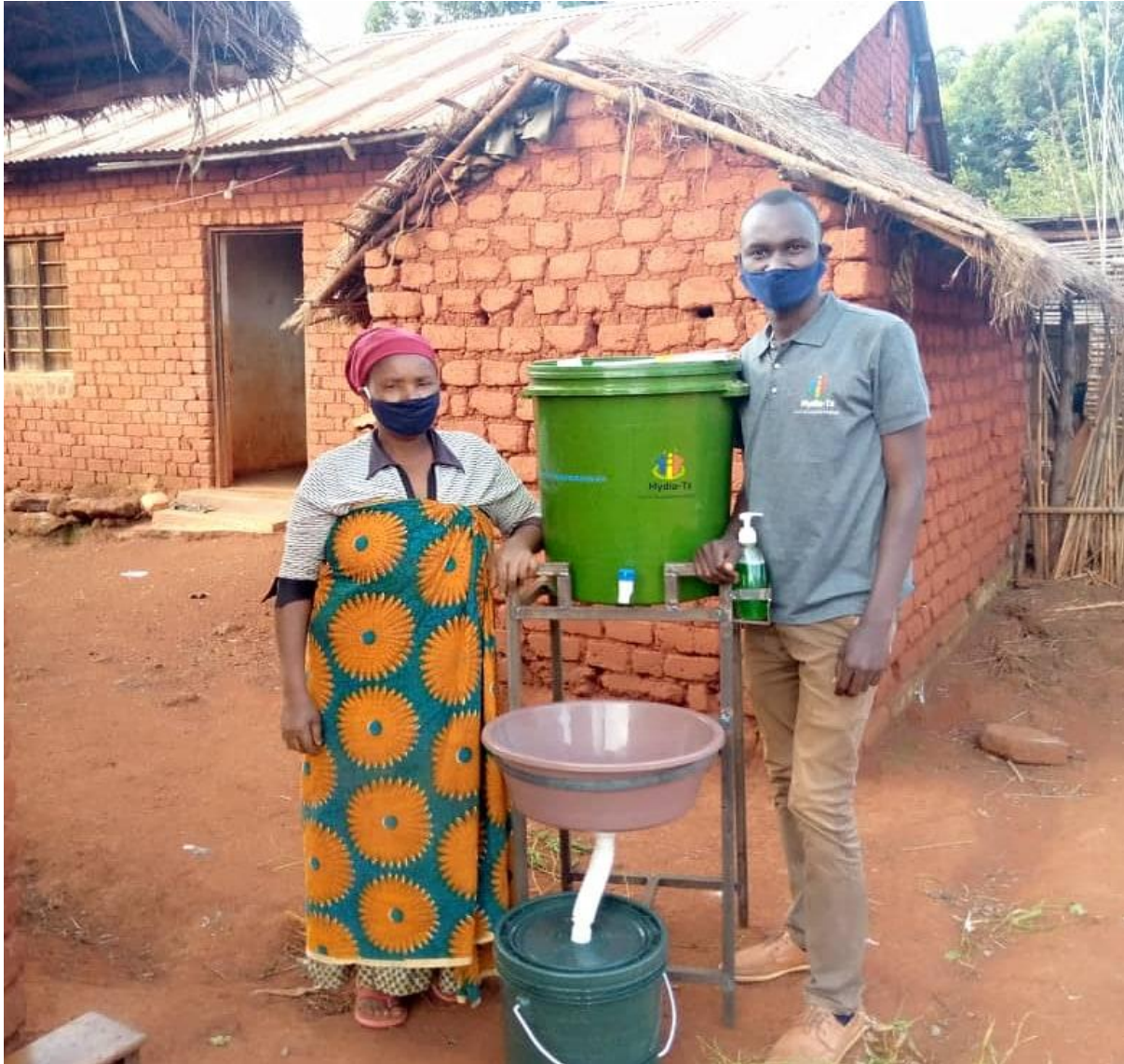
Photo: One of the Handwashing point provided.

areas and conducted hygiene promotion training for 50 community members of Biharu ward, as efforts to respond to COVID-19 pandemic.