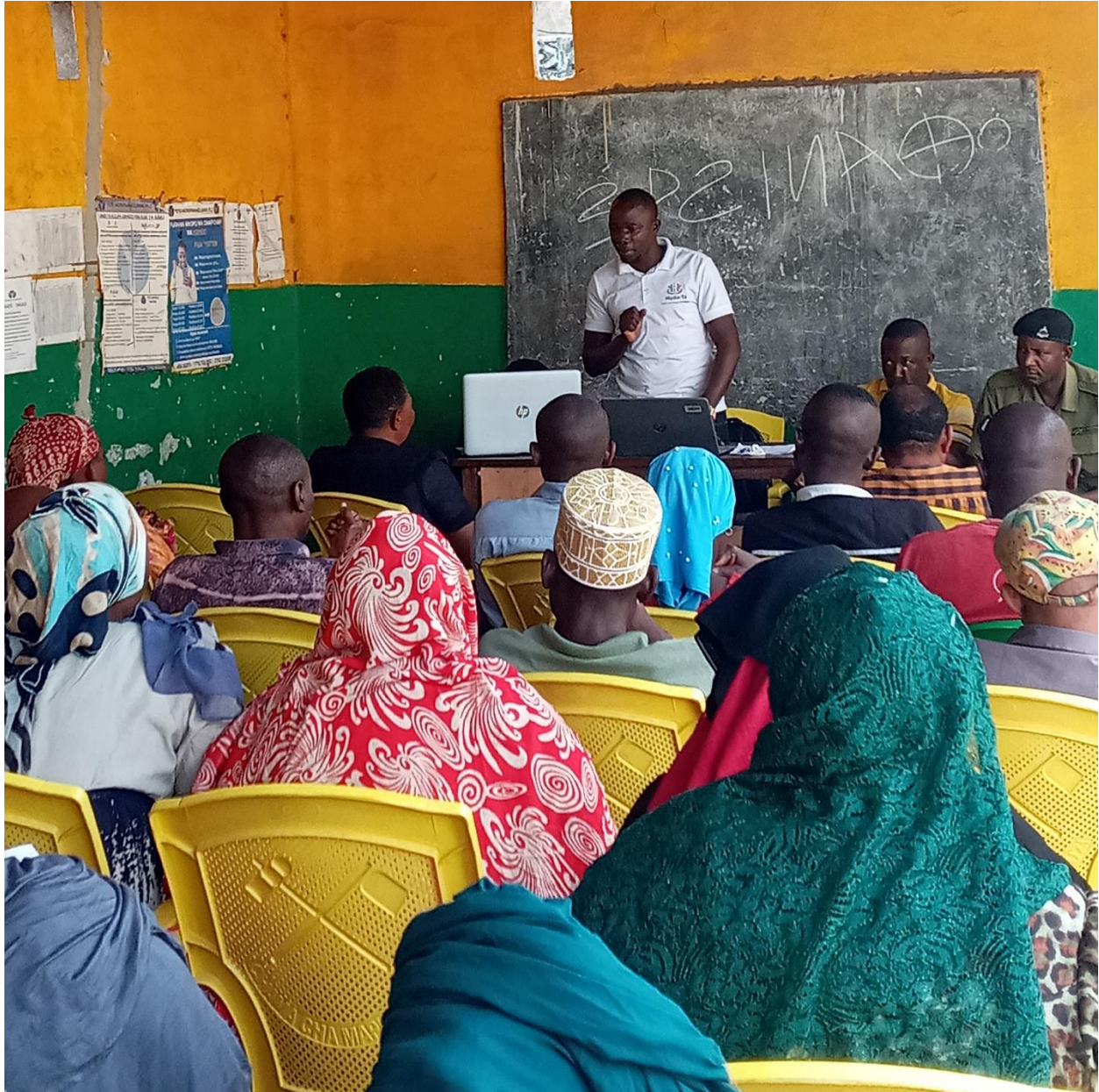
Photo: One of the training session, at Vingunguti ward of Dar es Salaam, Tanzania

Additionally, with the support from Cambridge Development Initiatives (CDI), Mydia-tz conducted a two days Hygiene promotion training for 100 community representatives/WASH committee of the Vingunguti ward in Dar es Salaam, Tanzania.