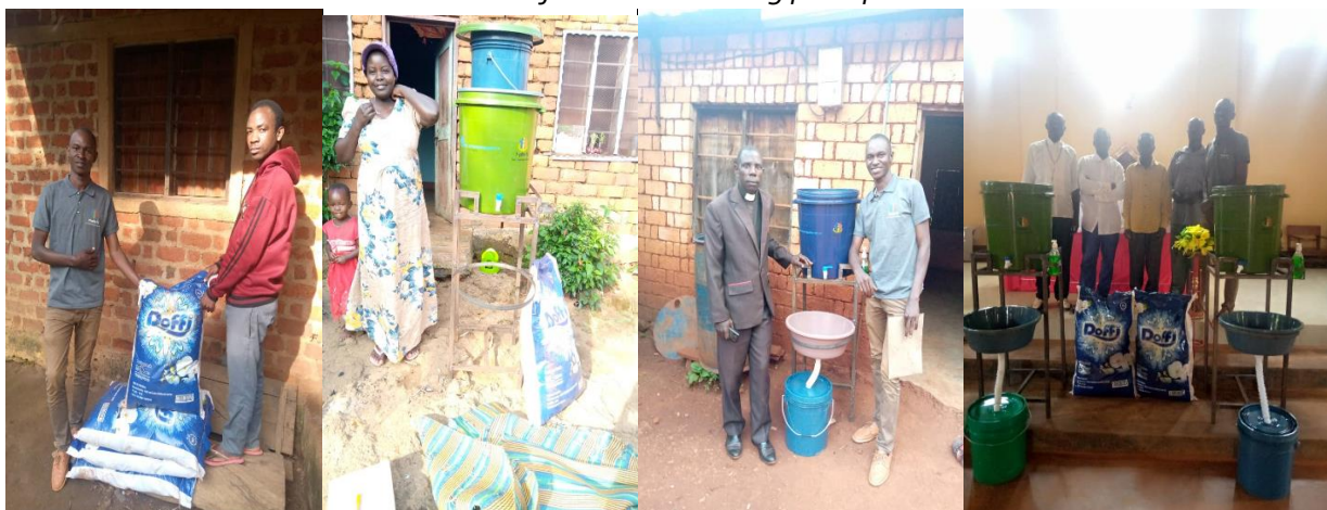
Photo: Distribution of powder soap and other items, at the Biharu Ward Executive Director's office