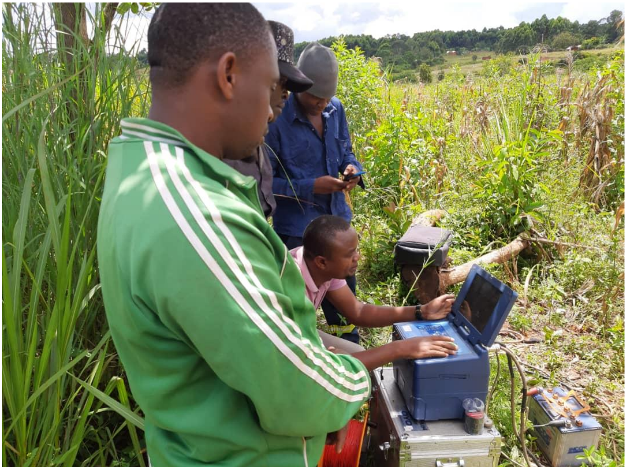
Photo: Hydrology study at Biharu ward of Buhigwe district, Kigoma region – Tanzania